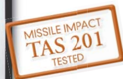
High speed sliding door Model Armatech