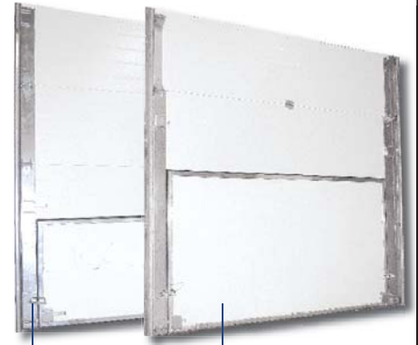
Breakfree™ 430 4" thick - 30" high bottom section