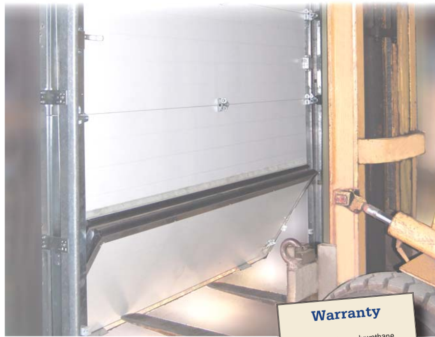
Breakfree™ 430 door shown hit from the inside

Note: For more information, please consult the Hardware - Thermostop Industrial Doors and the Operators - Thermostop Industrial Doors brochures.