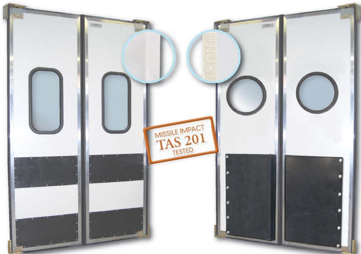
EPS foam core impact traffic door Model Glace-Guard™ Impact Traffic HD (Heavy Duty)