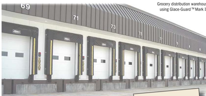
Grocery distribution warehouse using Glace-Guard™ Mark III