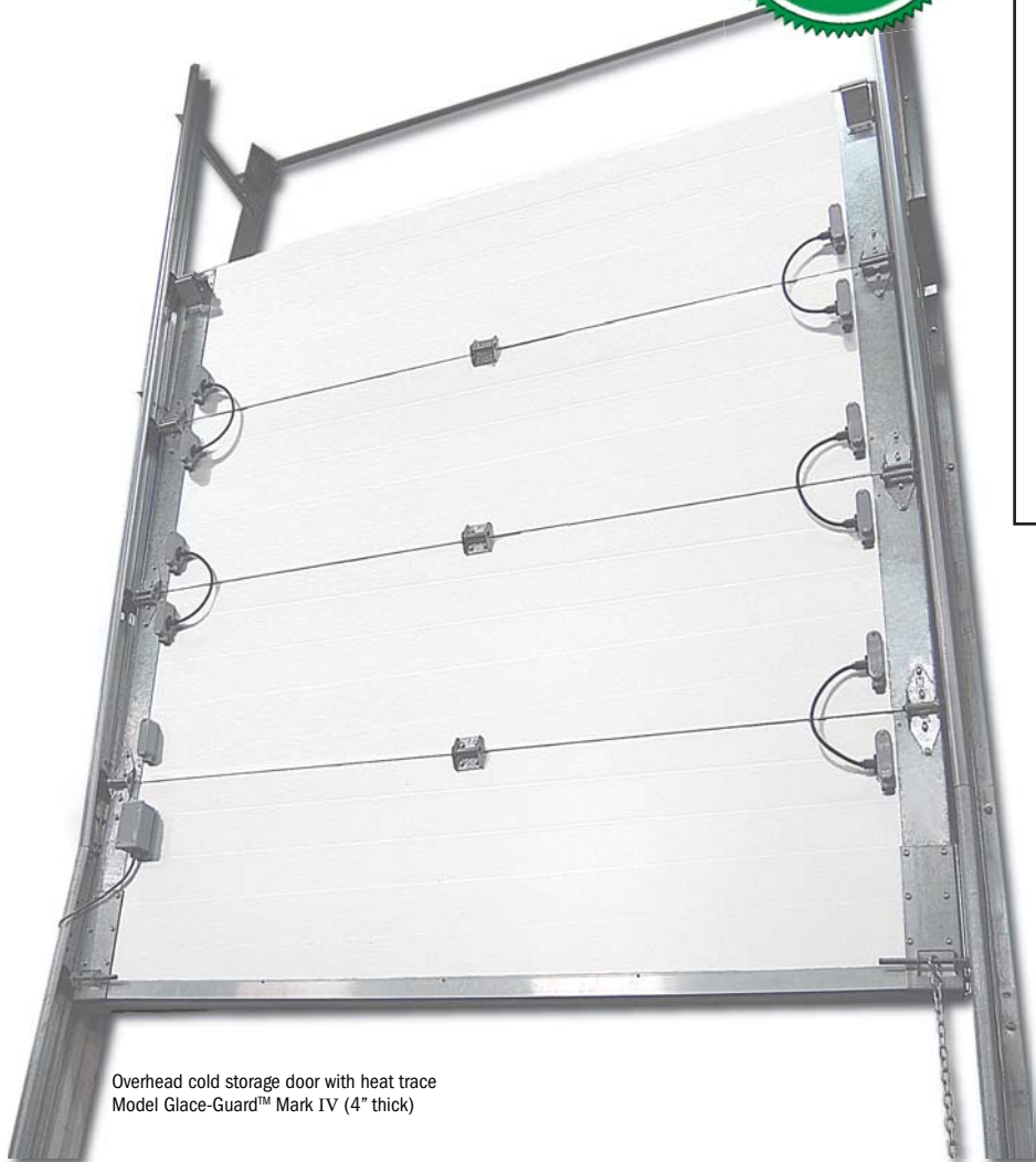
Overhead cold storage door with heat trace Model Glace-Guard™ Mark IV (4" thick)